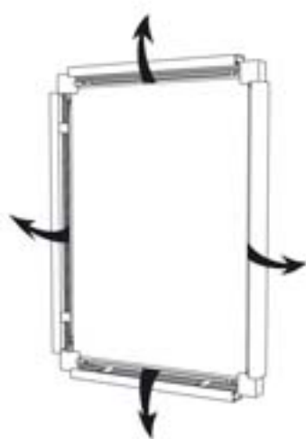
1. Snap open.