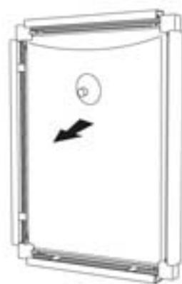
2. Suck out the transparent sheet.